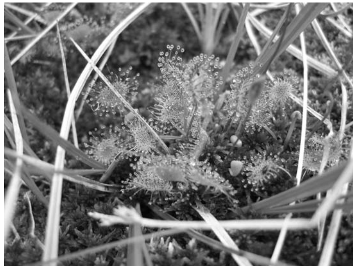
Round Leaved Sundew.

The 25 participants were split into five teams. A total of five sites were visited as a result of this effort, three of which had documented round leaved sundew occurrences, the other two supported similar habitat. Each team was assigned a leader who ensured the following five deliverables were accomplished at each site: 1) confirm sundew occurrences and update