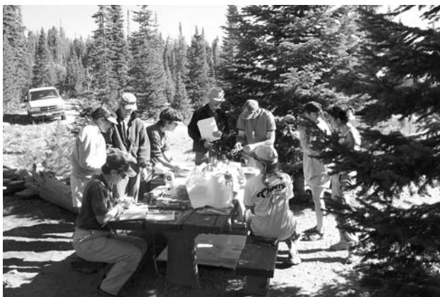
Group Plant Keying Session.

If you are interested in participating in this years Field Studies Project, see announcement for volunteers on page 11.