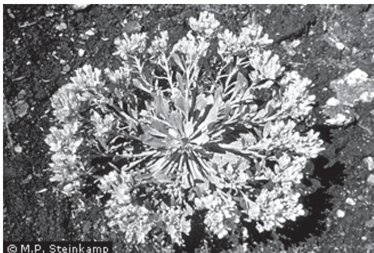
Bell's twinpod, Physaria bellii .

Aquilegia is available via email as an Adobe document. File size is typically 2-3 MB and fast internet connections are needed to download or view it. Send your email address to Eric Lane, eric.lane@ag.state.co.us .