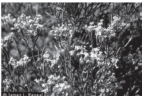
Clay loving wild buckwheat, Eriogonum pelinophilum.