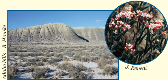
Adobe hills - B. Hauke

The clay-loving wild buckwheat ( Eriogonum pelinophilum ) is an endangered wildflower that grows only on the adobe hills of western Colorado. This beautiful wildflower occupies less than 500 acres in Montrose and Delta counties and occurs nowhere else in the world.